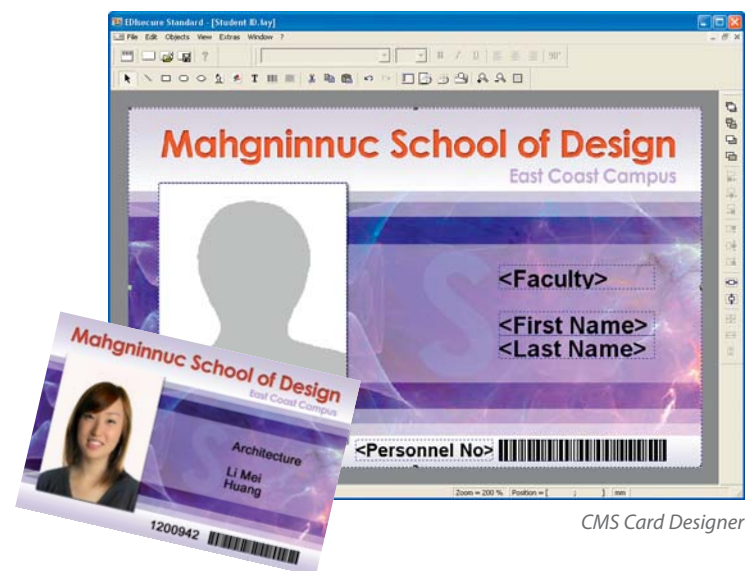
CMS Card Designer