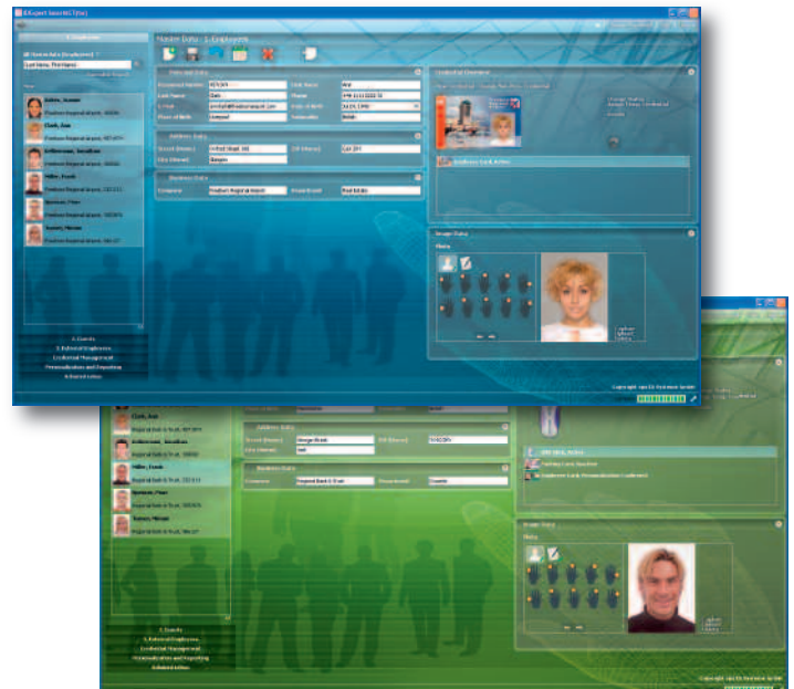
IDExpert ® SmartACT