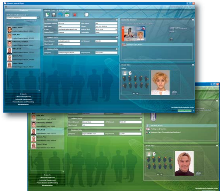
IDExpert ® SmartACT